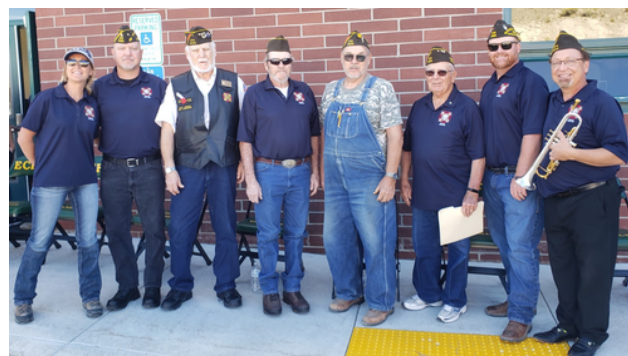
Members of the local VFW Post pose for a photo following the ceremony