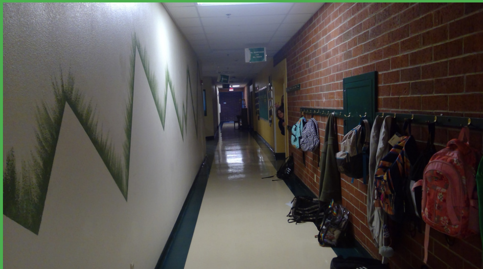
The "haunted hallway" where ghosts are said to roam.

So, is the school haunted? There is a real possibility, and the only way to know for sure is to go searching for yourself! However, if you do, be sure you're quiet about it, because staff and students may want to play a little harmless prank if they find out.